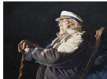
"Old Salt" by Douglas Wiltraut