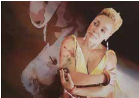
Déjà Vu 22 x 32 $2,200.00 Jacqueline Dorsey Athens, GA