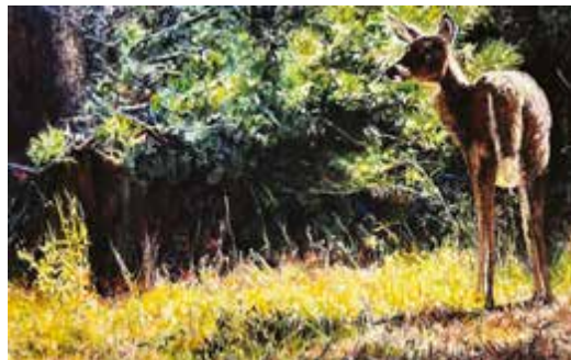
Edge 28 x 18 $2,447.00 Frank Wengen Dallas, PA