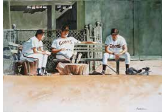
San Jose Bullpen 14 x 20 $800.00 Tim Swartz Spring City, PA