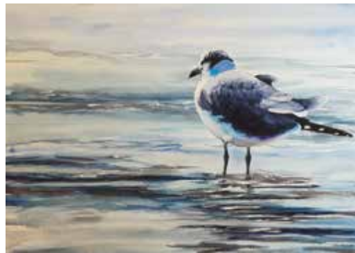
Toes In The Water