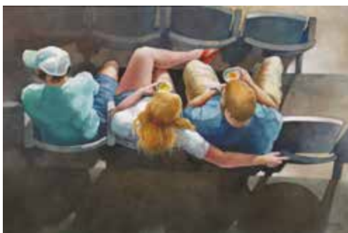
Who's On First? 15 x 22 $2,500.00 Alexis Lavine Greensboro, NC