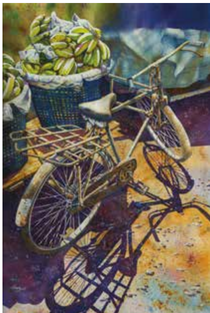
Tales Of Wheel 23 40 x 30 $8,000.00 Kerk Hwang Lok Batu Pahat, Johor