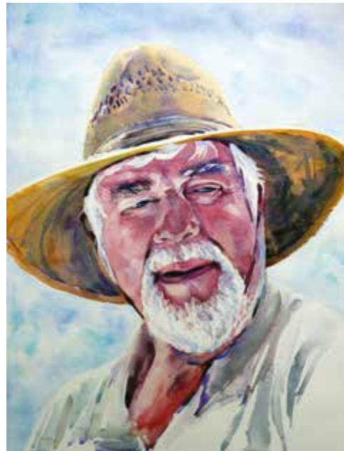
Approaching Storm 24 x 21 $950.00 Sally Davies Greenbelt, MD