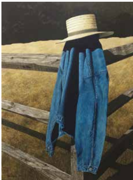
Denim 42 x 34 $3,800.00 Howard Eberle Lewes, DE #1 - 1st Place Award