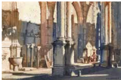
Carmo Convent, Lisbon