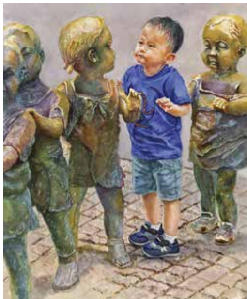
Fitting In #2