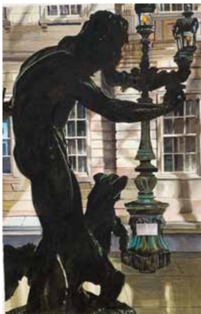
Still Learning 21.5 x 14 $1,900.00 Jim Kuhlman Fallston, MD