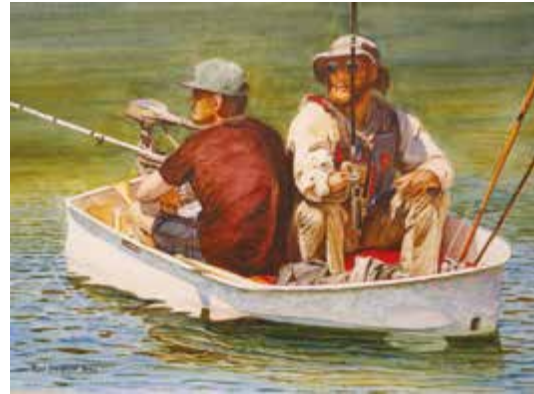
Waiting For A Bite 16 x 20 NFS Keith Shebesta Amelia, OH