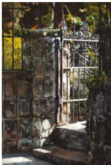
Warm Invitation 29 x 20 $6,500.00 Xi Guo St. Augustine, FL