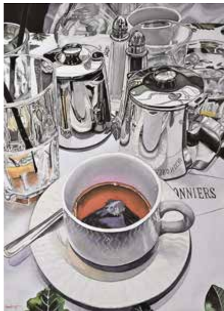
Paris: Apres Le Dejeuner (After Lunch) 30 x 22 $3,000.00 Allan Butt Concord, NC #15 Free Spirit Watercolor Award