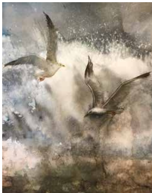
The Seagulls And Raging Sea 12 x 18 $500.00 Han In Huang Wong Newport News, VA