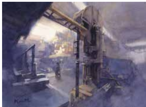
Giant Saw At Sunset