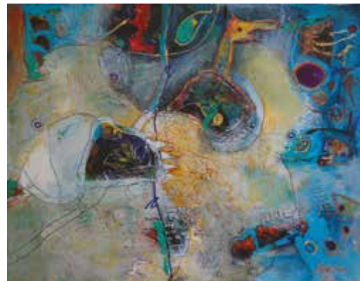
The Golden Goose 10 x 13 $500.00 Toni Elkins Columbia, SC #14 Dixon Ticonderoga Award