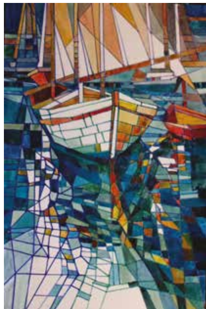
Dance Of The Seven Sails 22 x 15 $2,200.00 Marilynne Bradley Webster Grvs, MO