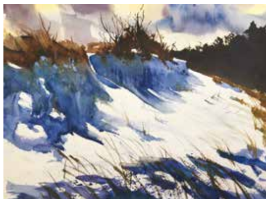
The Passage 11 x 14 NFS Paul George Ipswich, MA