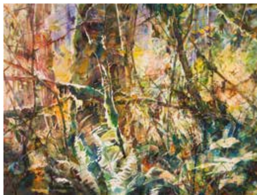
Morning Mood 51 x 69 $5,500.00 Stephen Zhang Plano, TX