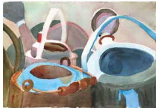
Can Can 15 x 22 $250.00 Barbara Sowinski Lansdale, PA