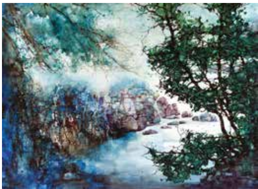
Morning Creek 22 x 30 $3,500.00 Z Feng Radford, VA