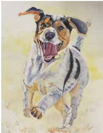
Happy Annie 20 x 14 $700.00 Brenda Cretney Brockport, NY