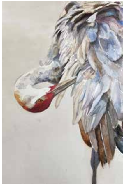
Sandhill Sprucing Up 22 x 15 $350.00 Nina Tarnuzzer Gainesville, FL