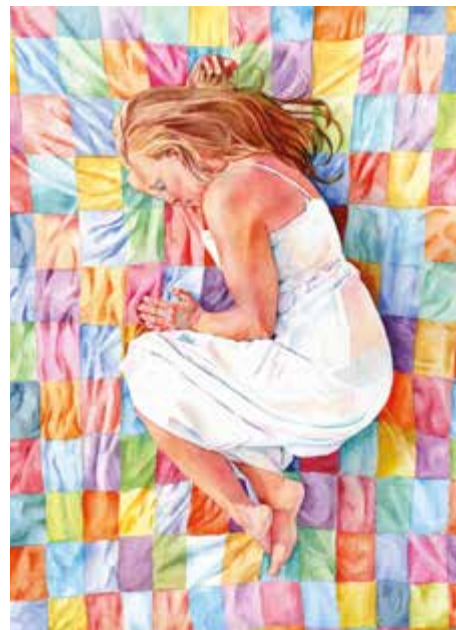
Quilt Stories 13 30 x 22 $1,200.00 Deborah Conn Falls Church, VA