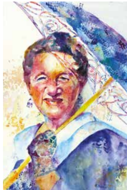
Lavender And Old Lace 22 x 15 $750.00 Kathleen Durdin Tampa, FL