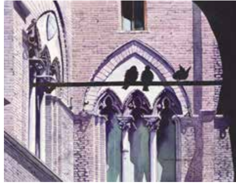
Waiting In The Shadows