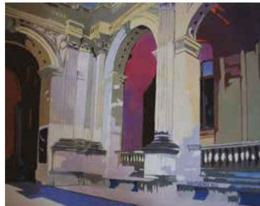
Illusions Of Grandeur 14 x 23 $1,400.00 Kristin Stashenko Medfield, MA